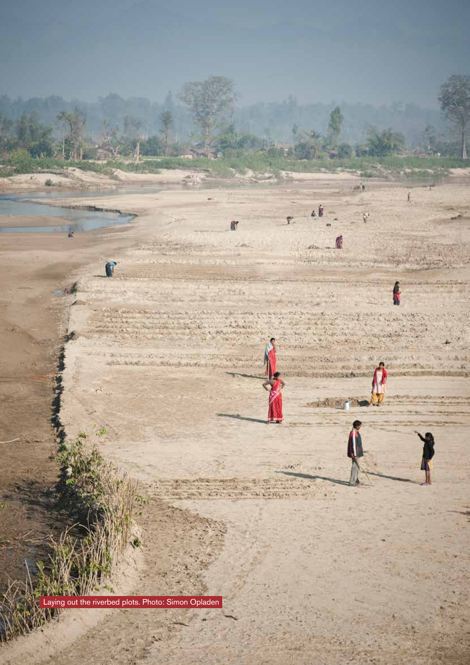
Laying out the riverbed plots.