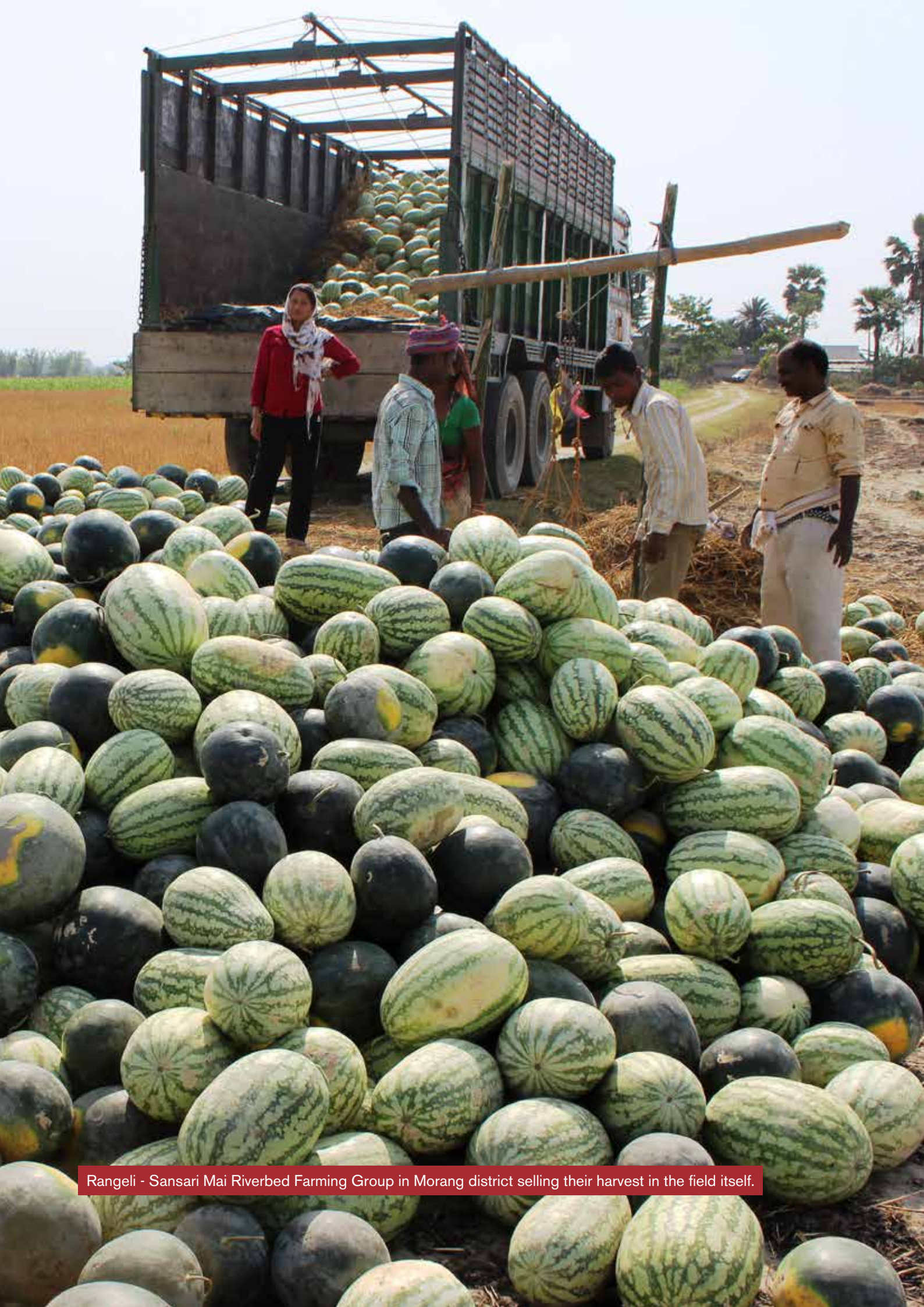
Rangeli - Sansari Mai Riverbed Farming Group in Morang district selling their harvest in the field itself.