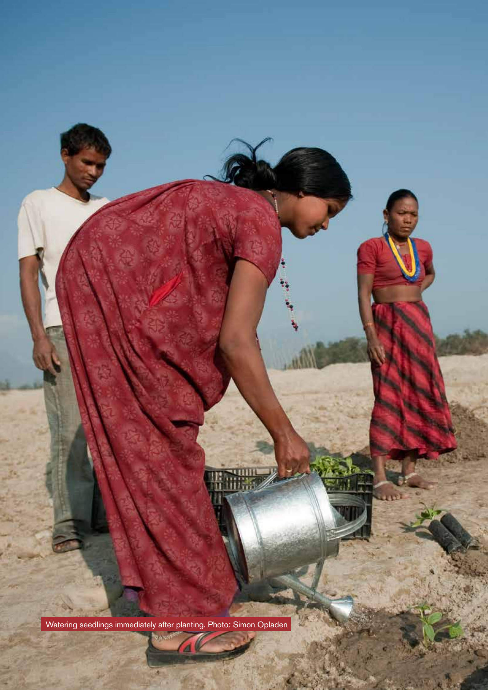
Watering seedlings immediately after planting.