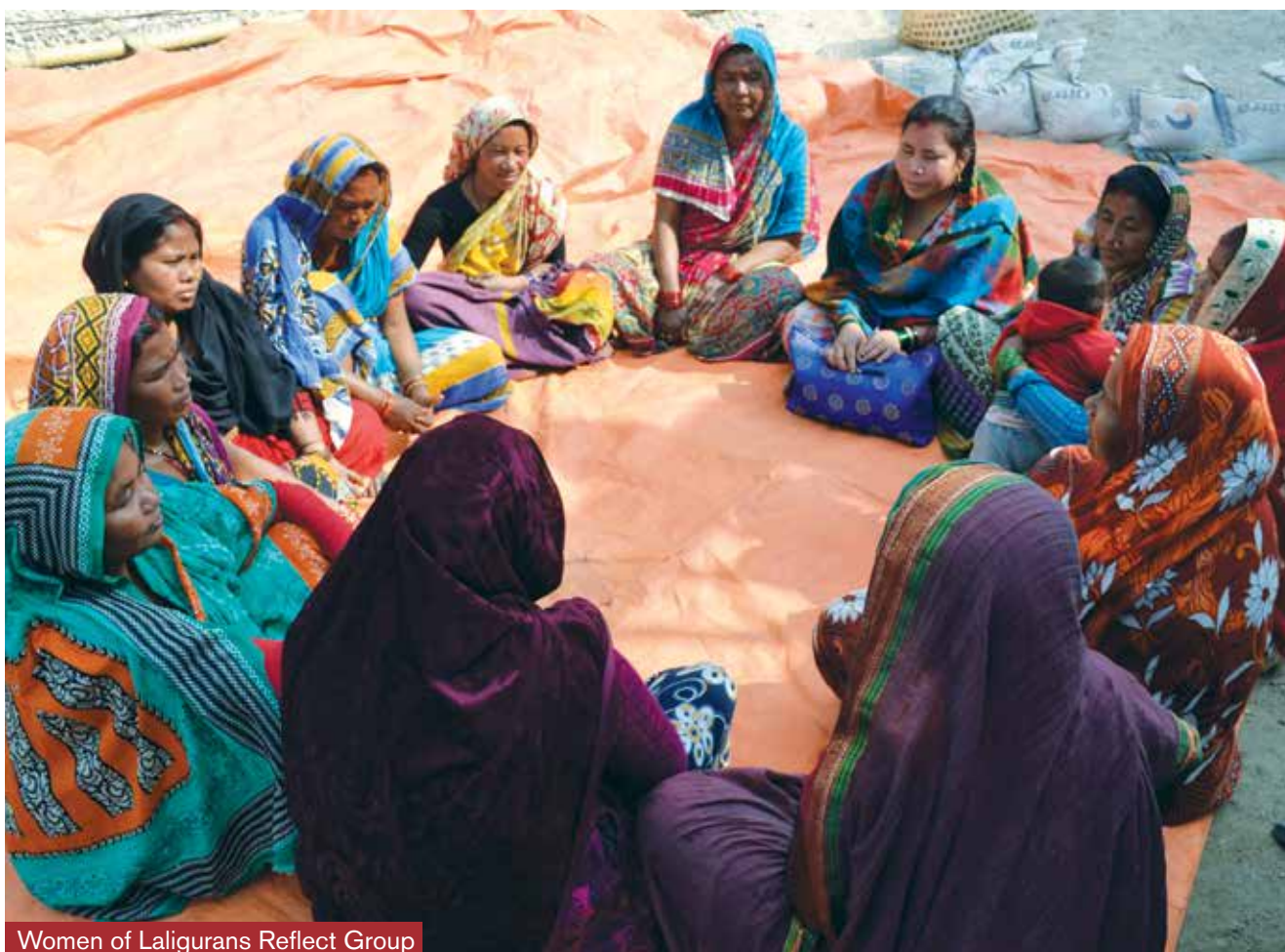
Women of Laligurans Reflect Group

In their first reflections, the women identified three issues that were particularly important to them. These were the local cessation of the door-to-door child vaccination programme (meaning they had to travel to the Health Post); the lack of a local place to sell their vegetables; and the importance of women's education and therefore avoiding child marriage. Accordingly, they campaigned for the re-institution of the vaccination programme, which was successful. They then investigated the possibility of selling vegetables at the weekly market, which they hope to begin with the next harvest. They also organised a campaign, including a street drama, on the importance of girl children completing their education and not becoming child brides.