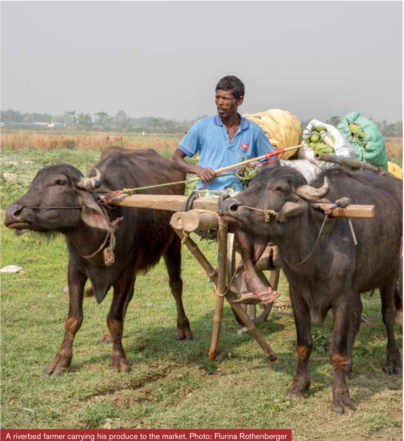
A riverbed farmer carrying his produce to the market.

Although Helvetas was the first external agency to support riverbed farming, others have “crowded in”, especially following the early positive publicity from the World Bank award. As a result, the Riverbed Farming Alliance was formed in 2011 to promote national-level awareness of riverbed farming. Helvetas is one of six current members of this alliance, which, working in collaboration with the then Ministry of Federal Affairs and Local Government (MoFALD) was able to draft a Local Riverbed Farming Promotion Policy, finalised in 2012. This effort was overtaken by the process of federalisation, under which riverbed farming has effectively become the responsibility of Nepal’s 753 new rural and (urban) municipalities. Nevertheless, the draft policy remains a useful resource document that can contribute to the agricultural policy development of the relevant State and local governments (notably for States 7, 5, 2 and 1).