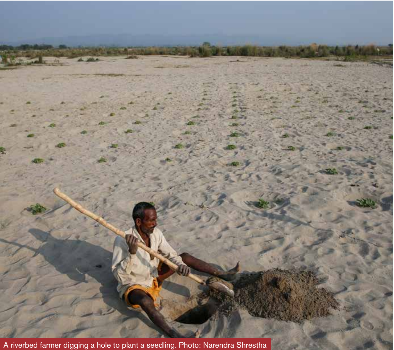
A riverbed farmer digging a hole to plant a seedling.

in part because some families that had taken up riverbed farming had immediately invested their vegetable-growing profits in leasing private land, or even buying riverbed land.