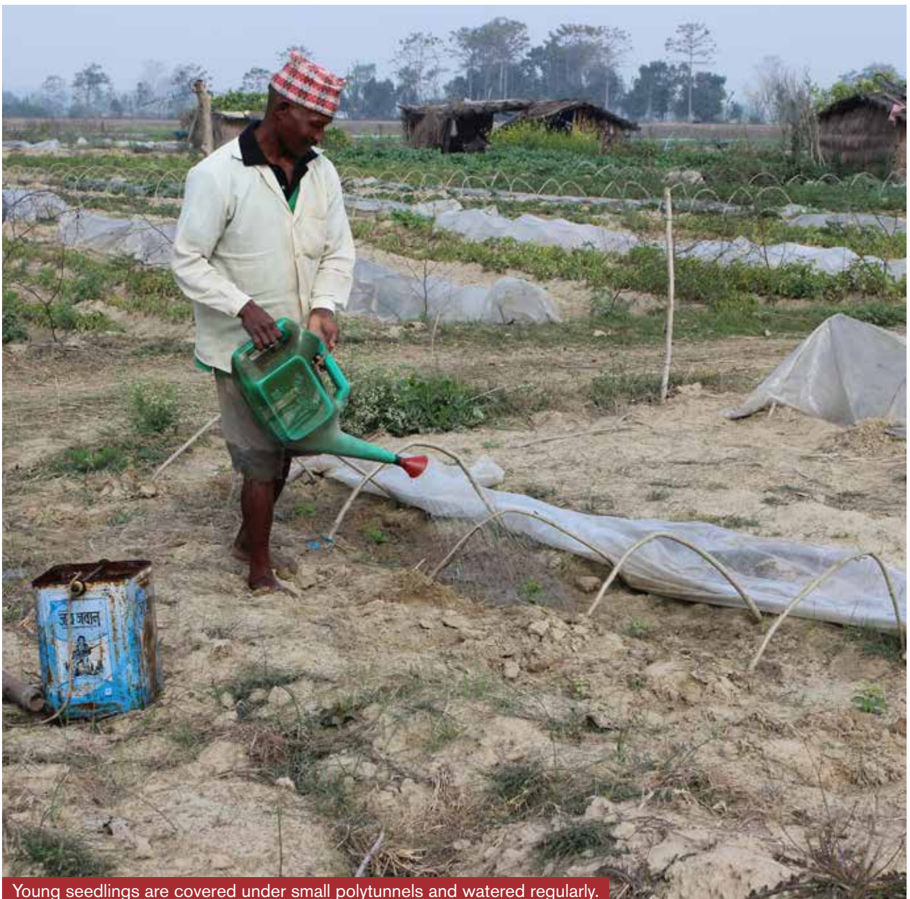
Young seedlings are covered under small polytunnels and watered regularly.

Perhaps the most negative tendency in riverbed farming today is the potential for growing inequality within and between the farmer groups. The original concept of riverbed farming – that of landless or land-poor households taking public land on a free but limited term lease – has now expanded considerably, with many households renting privately owned riverbed land, or even buying such land themselves. The mini-survey conducted for the review (RIDA, 2017) found that the average area farmed by one household is now around 8 kattha (0.27 hectares), although this hides considerable variation – with those households only able to gain access to public land (25% in the mini-survey) leasing a maximum 4 kattha (0.13 hectares) whilst those leasing private land, or a mix of public and private, generally farming at least 10 kattha (0.33 hectares). The remaining 18% percent of the households in the mini-survey were farming their own riverbed land. This divergence is significant, in that there are economies of scale with riverbed farming, meaning that households farming more land make significantly greater profit per unit of land.